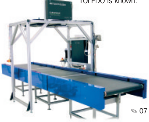
METTLER TOLEDO provides the solutions to serve you at all levels of dimensioning.

Speed, accuracy, and identification capabilities are all requirements which can be satisfactorally fulfilled by know-how, competence and reliability for which METTLER TOLEDO is known.