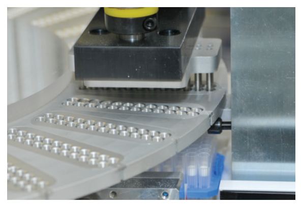
Automated filter assembly, no human contact